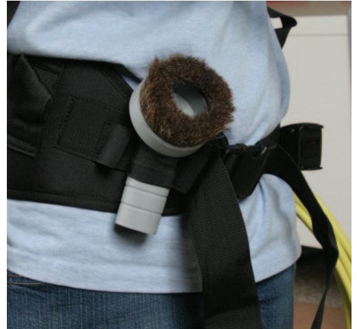
The belt has convenient tool storage.