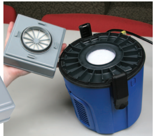
Optional H.E.P.A. filter is easy to change.