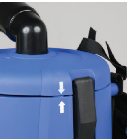
Arrows assist operator with securing canister lid and latches in the correct position. Easy to snap latches allow access to the canister and paper bag.

Onboard tool storage for quick and easy tool change. The complete tool kit is ideal for carpet and hard floors, overhead, and detail cleaning operations.