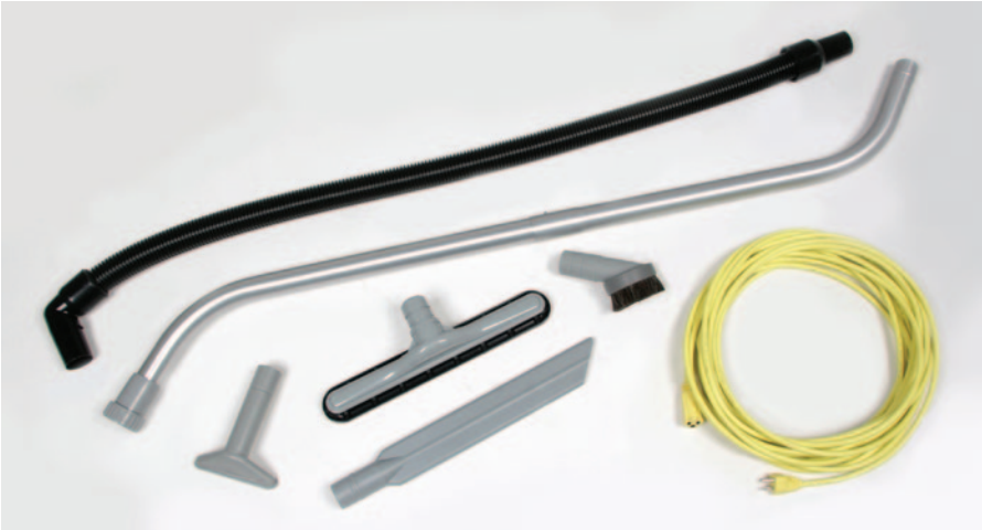
The standard tool kit fits all your cleaning needs. Ideal for carpet and hard floor areas.