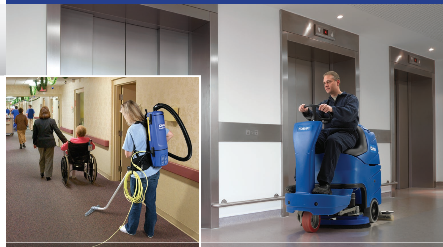
The lightweight Comfort Pak vacuum features an innovative ergonomic frame for superior comfort and support, plus easy, mess-free bag changes.